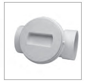
The HDPE valve lid is impact-resistant and impervious to most solvents and glues. The notch is sized to fit the end of a 2x4 for easier removal and replacement.