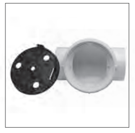
Different-sized tabs in the carrier will only fit into the valve body when correctly aligned, which helps prevent improper installation of the flapper.